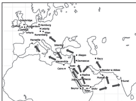
Figure 1. Diffusion of Coffee in the World

The first coffee house in England opened in Oxford in 1650. London soon followed suit. In France, coffee houses appeared in Marseille around 1671, and in Paris after that. The coffee-drinking culture soon made its way to other European cities such as Amsterdam, Vienna, Nuremberg, Hamburg, and Leipzig [Ukers 2007: 20–100]. Coffee thus diffused throughout Europe in only half a century, from the middle of the seventeenth century, even though the production of coffee was restricted to Ethiopia and Yemen.