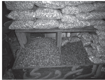
Figure 6. A Coffee Beans Shop in Yemen (Left : Roasted Husks [ qishr ], Right: Roasted Kernels [ bunn ])