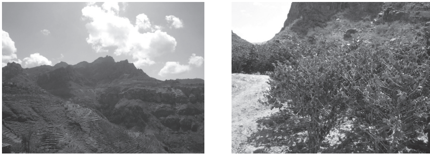
Figure 3. A Coffee Plantation in Yemen

Though Niebuhr's visit to Yemen was in the eighteenth century, his account tells us that there was a kind of irrigation system in place. He also reports that the local people there were more accustomed to European people than anywhere else in Yemen, but were a little suspicious of the members of his expedition because they did not seem to be European merchants wanting to trade in the area [Niebuhr 1994: 294–295]. This testifies to the presence of European merchants in the interior of Yemen to purchase coffee. However, usually the coffee beans cultivated there were bought by middlemen, such as Arab or Indian merchants, then taken to Bayt al-Faqīh, a market trading in the coffee produced in the highlands, from which it was exported by both land and sea.