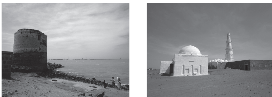
Figure 5. The Port of Mocha and the Shrine of a Sufi Saint

One was the inland route leading to Mecca, Medina, Damascus, Aleppo, and Istanbul. This was the traditional trade route, used in ancient times for transporting frankincense and later for the spice trade. Caravans transported the cargo; risks along this route were few because it was less affected by adverse weather conditions. The other primary route was through seaports located in the western coastal area of the Arabian Peninsula. They included Jidda, al-Ḥudayda, al-Luḥayya, and the most important, Mocha (al-Mukhā). In that period, Mocha was not only a trading port but also a military port and port for pilgrimage. In 1647, the Yemenite ambassador, al-Ḥaymī, travelled to the African seaport Bayrūr from Ṣan‘ā’ by way of Mocha, and reported that there were many naval ships there, in fear of the Ottoman army, which was stationed at Sawākin and Maṣṣawa‘, seaports along the African east coast [Donzel 1986: 103]. In the chronicle of Yemen, there are also descriptions of the pilgrimage of Sultan Uzbek from Kashgar to Mecca; he landed at Mocha with 500 soldiers and servants in 1669 [Yaḥyā b. al-Ḥusayn 1996: 183–184; Um 2009: 56]. From these descriptions, we know that Mocha played an important role in this era, not only commercially but also politically.