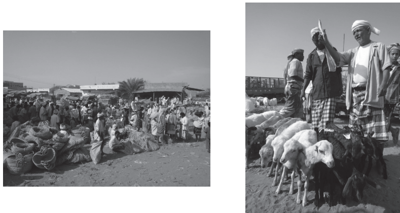
Figure 4. Bayt al-Faqīh

After being cultivated and harvested in the mountains of Yemen, the coffee beans were taken to Bayt al-Faqīh. Niebuhr reports that it was in a favorable location for trade, because it was located half a day's journey from the coffee cultivation area, and a few days' journey to port cities such as al-Luhayya, al-Hudayda, and Mocha. He also said that merchants from Egypt, Syria, Iran, Ethiopia, India, Europe, and so on were attracted by the trade and came there [Niebuhr 1994: 272–273]. Coffee beans were purchased by such long-distance traders and exported from Yemen by two main routes.